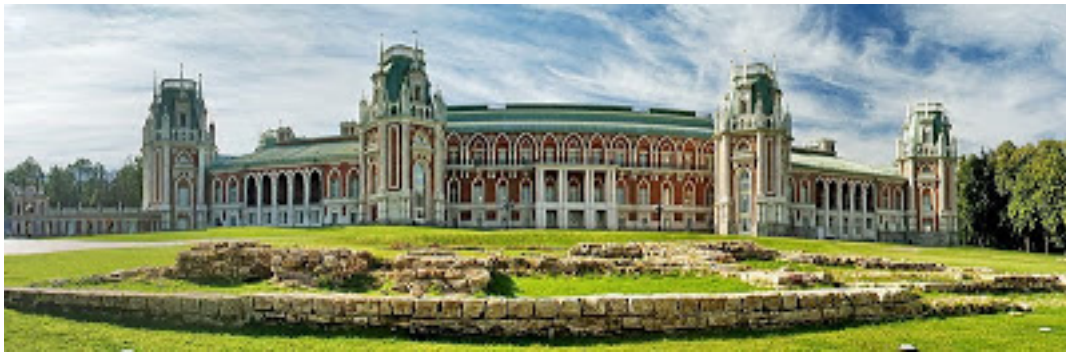
The State Museum Reserve Park Tsaritsyno. Moscow, Russia.